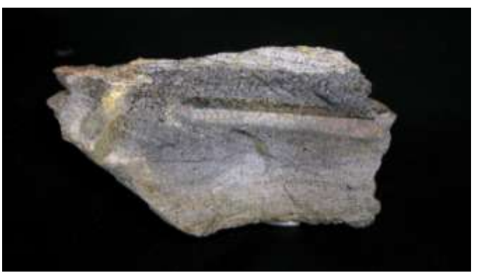
Staurolite, Sugar Hill. 2.5 inch crystal in 4 inch specimen