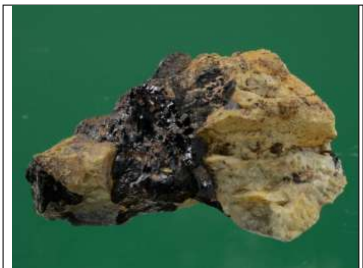
Chevkinite-(Ce) – black in matrix. 3 cm specimen Devil's Slide, Stark, NH

Seeing that the chevkinite-(Ce) chemistry allowed the inclusion of thorium (Th), I checked Don's specimen with my gamma radiation sensitive scintilometer. I could detect no elevated radiation level from the specimen.