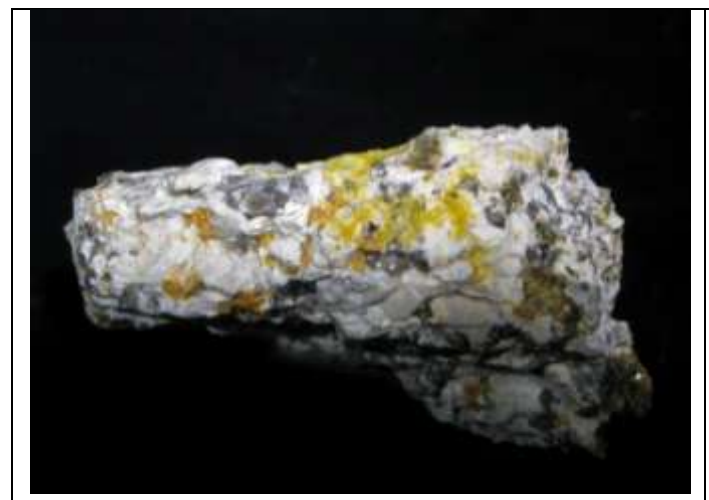
HUMBOLDTINE Government Pit, Albany, NH 6.5 cm specimen with orange-yellow humboldtine crust