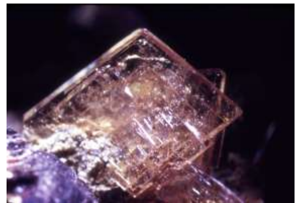
Leucophosphite 3.3 mm crystal Anthony R. Kamph photo and specimen